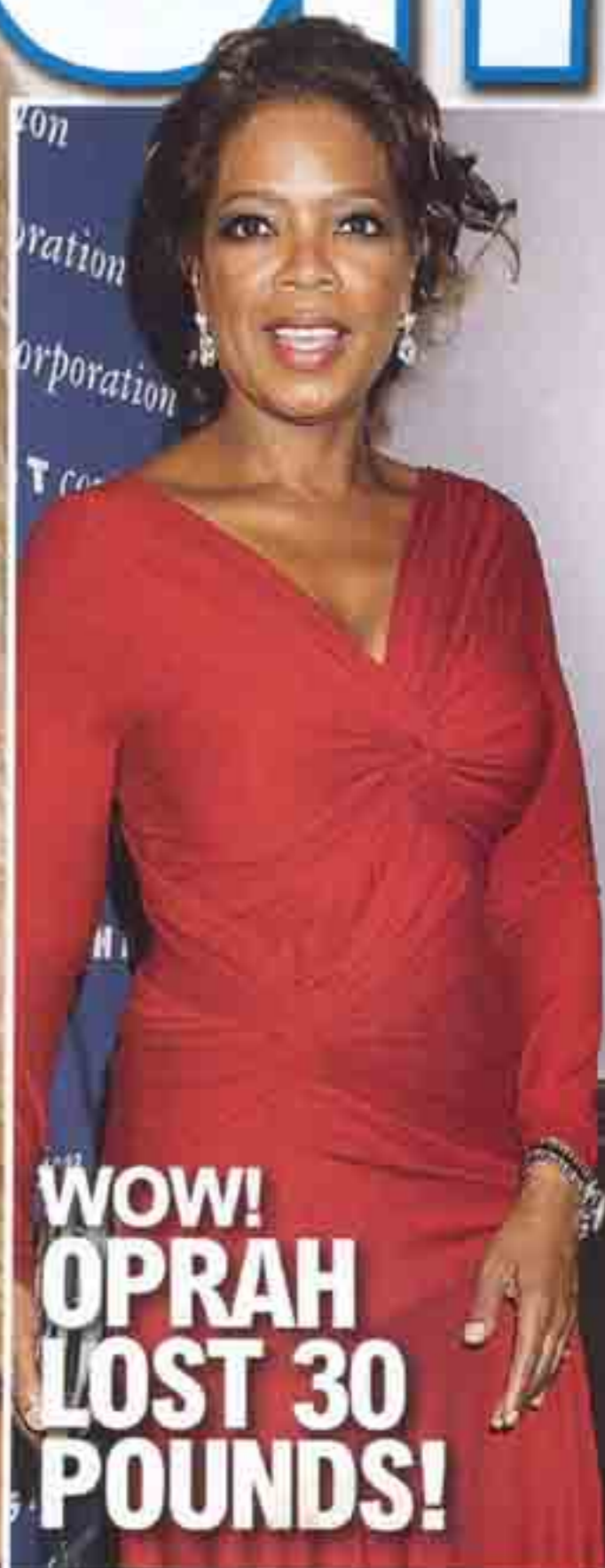
WOW! OPRAH LOST 30 POUNDS!

Stars like Mya, Gabrielle Union and Shannon Elizabeth are shielding their skin from the sun's harmful rays with Freeze 24-7's newest product, Ice Shield, the first facial cleanser that features an SPF 15 that stays on even after you rinse. Even the most cautious celebrities melted once they discovered that Ice Shield received the Skin Cancer Foundation's seal of approval for its aid in preventing sun damage to the skin. Other fans of Freeze 24-7's antiaging line include Renée Zellweger, Katie Holmes and Penelope Cruz. $48, freeze247.com.