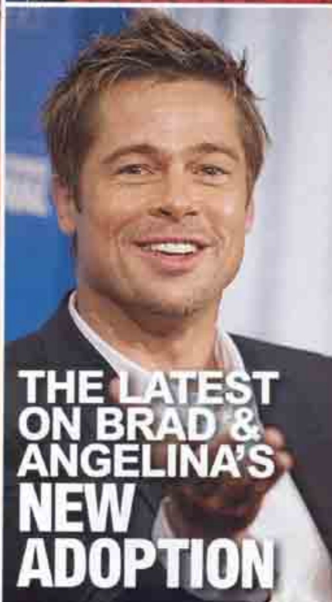
THE LATEST ON BRAD & ANGELINA'S NEW ADOPTION